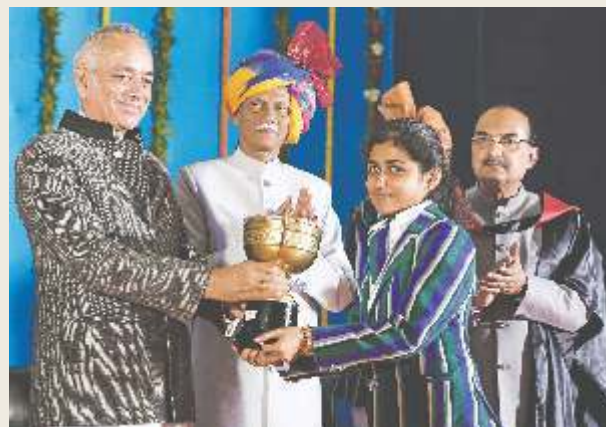
Gajapati Maharaja Dibyasingha Deb of Puri 2018-19