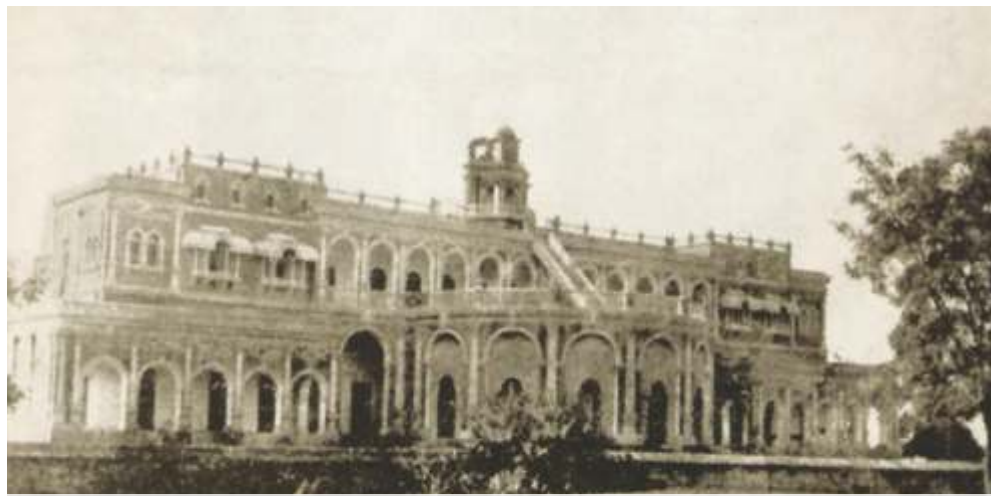
The School Building (1894-1915)