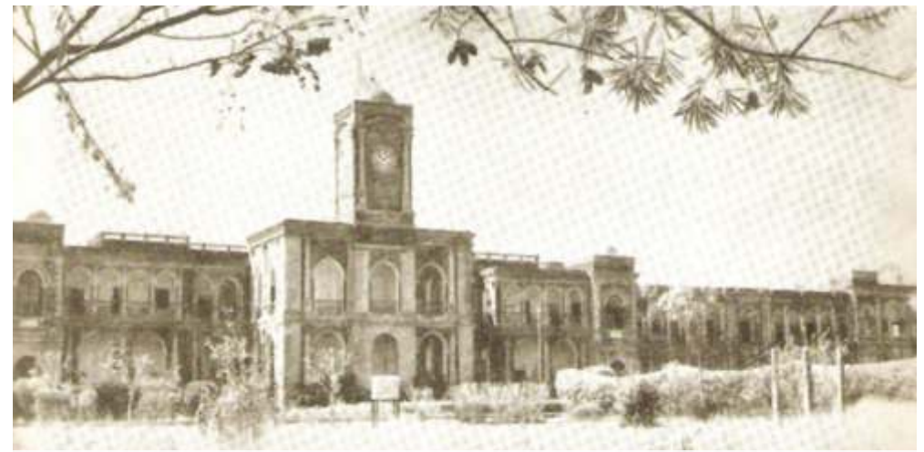
The School Building (1918)