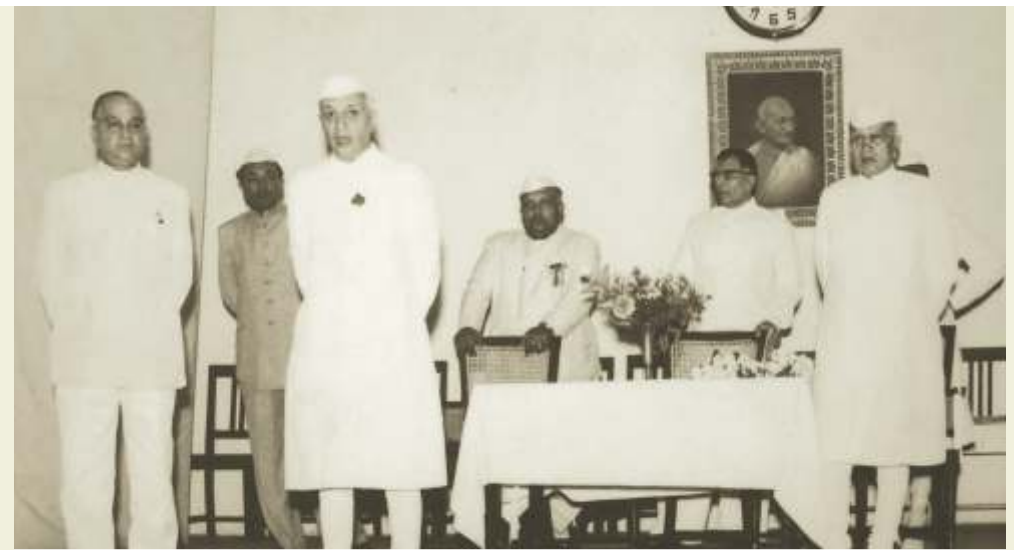
Visit of Pt. Jawahar Lal Nehru Prime Minister, India (1960)