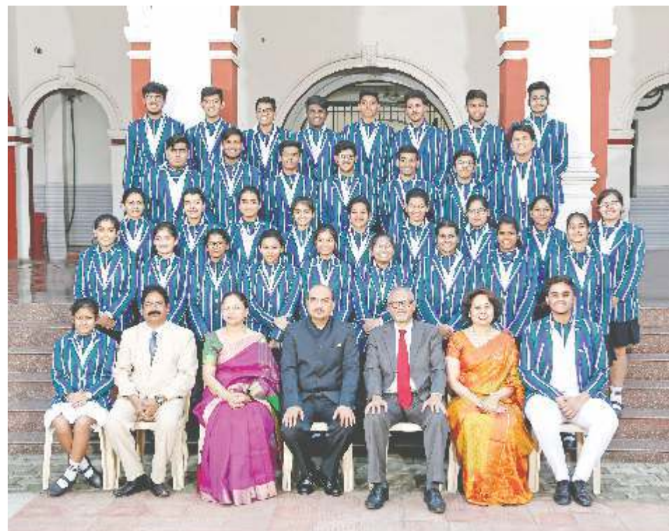
Prefects in Traditional Attire

A Boarding School is known for its prefectorial system. For the purpose of inculcating leadership and discipline among students, Prefects are appointed by the Principal on the recommendation of the faculty. These Prefects are responsible for the day-to-day discipline among the boys and girls in class rooms, play fields and in the boarding houses. The team of Prefects works under the overall leadership of the Head Boy and the Head Girl of the school.