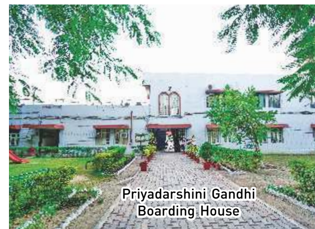
Priyadarshini Gandhi Boarding House