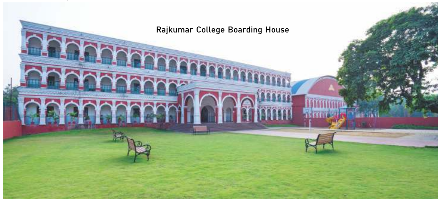
Rajkumar College Boarding House

The boarding houses are administered by House Masters, House Tutors and Matrons. There are separate boarding houses for boys and girls. The College has five boarding houses; Rajendra Das Boarding House (RDBH), Balram Das Boarding House (BDBH), Priyadarshini Girls' Boarding House (PGBH) and Rajkumar College Boarding House (RCBH). The Rajendra Das Boarding House and the Balram Das Boarding House are named after the donors of the State of Nandgaon and they house the Senior boys. PGBH is for all girls, and is equipped with all modern amenities including a air conditioned dormitories. A new air conditioned hostel RCBH accommodates boys upto class VIII. All records of students are confidential and can only be shared with parents and guardians. The hostels are equipped with Badminton & Basketball Courts, Pool and Table Tennis Tables. All hostels have dedicated wardens and house staff.