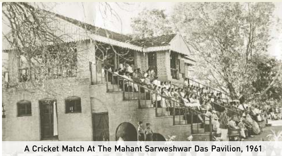
A Cricket Match At The Mahant Sarweshwar Das Pavilion, 1961