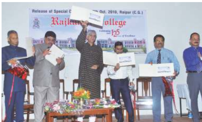
Release of Special Cover of RKC by Dept. of Posts