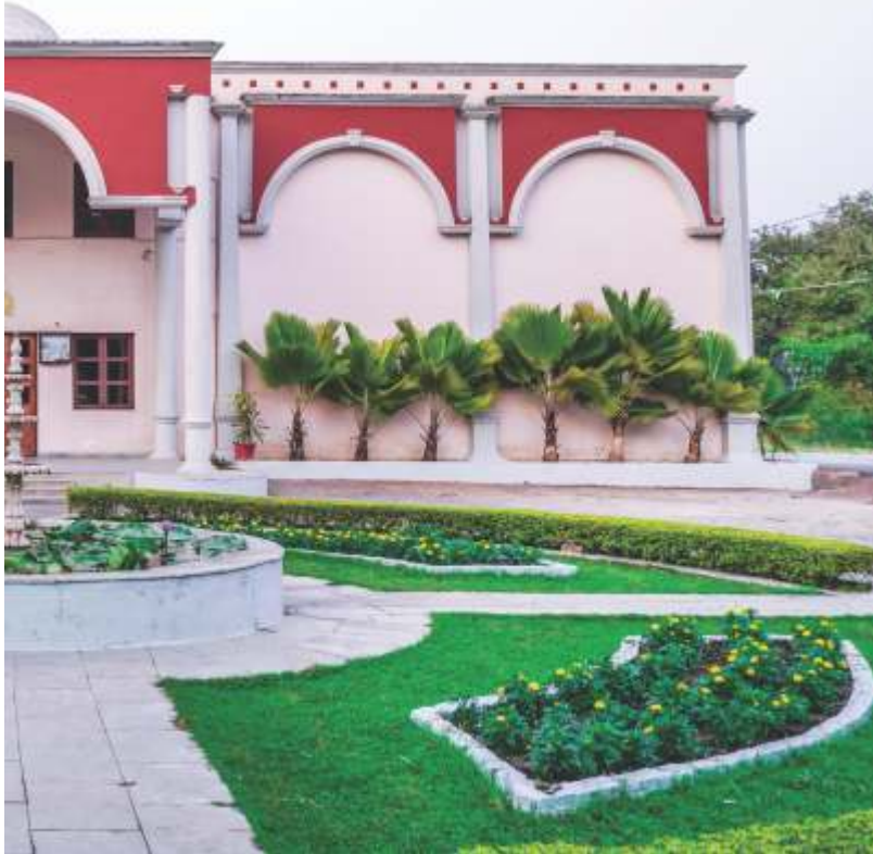
Jubilee Hall (Squash Courts & Gymnasium)