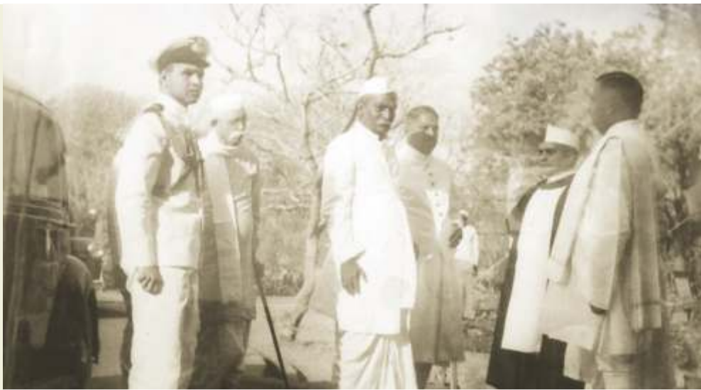
Visit of H.E. Dr. Rajendra Prasad President, India (1953)