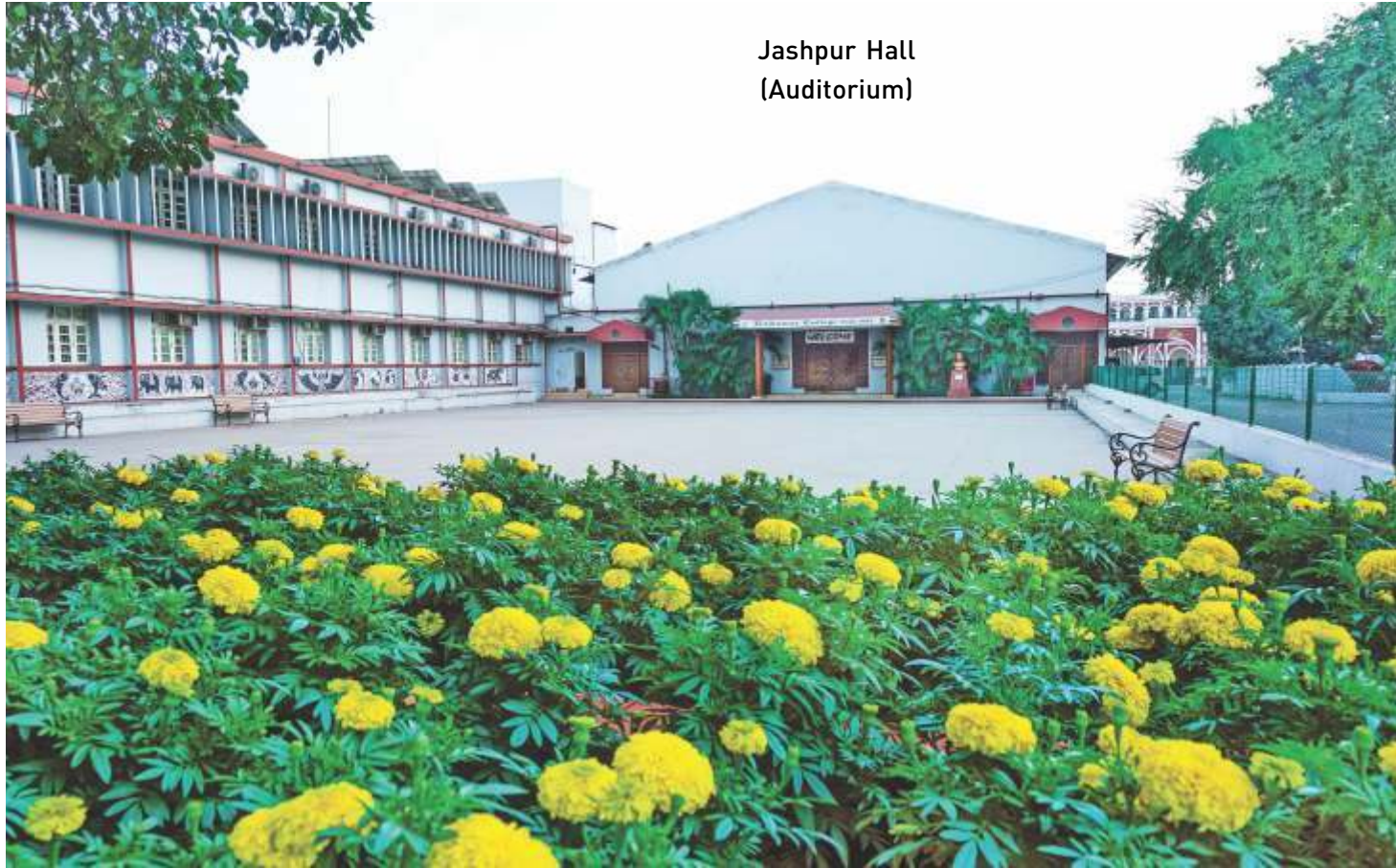
Jashpur Hall (Auditorium)