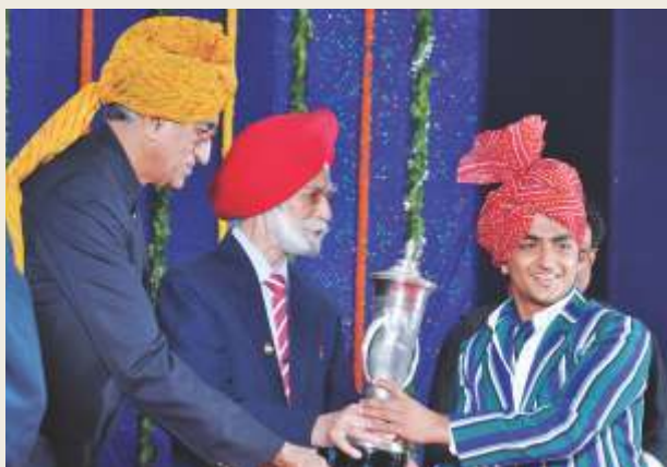
Padmshree Balbir Singh (Senior) Olympic Icon, winner of 3 Olympic Gold Medals in Hockey and the winner of Hockey World Cup, 1975 2013-14