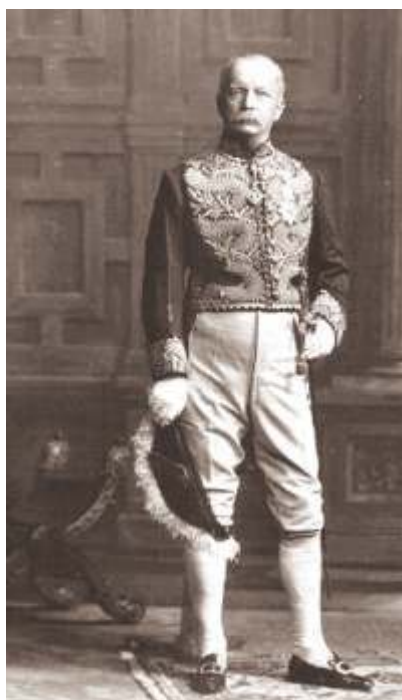
Sir Andrew Fraser, KCSI, ICS