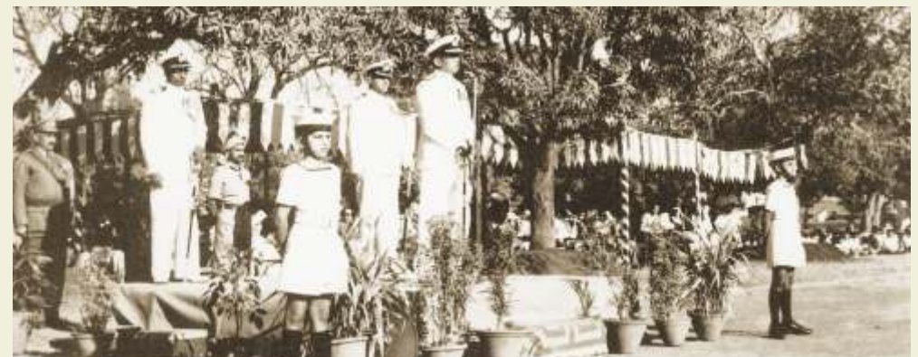
The Chief Guest Vice Admiral Ram Dass Katari PVSM, AVSM at Guard of Honour 1960