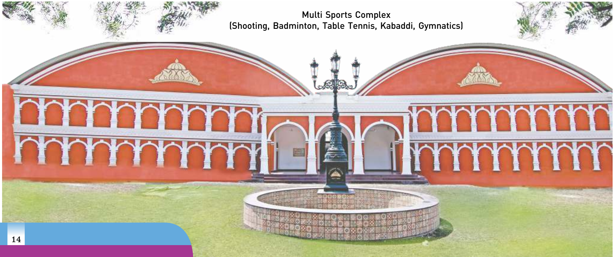
Multi Sports Complex (Shooting, Badminton, Table Tennis, Kabaddi, Gymnastics)