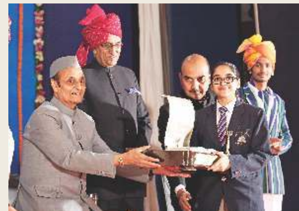
Padma Vibhushan Maharaja Dr. Karan Singh of Kashmir Member of Parliament 2016-17