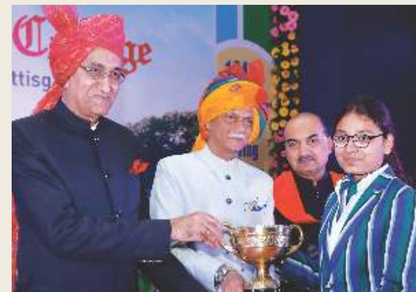
Maharaja T.S. Singh Deo of Surguja Minister for Health and Family Welfare Government of Chhattisgarh 2019-20