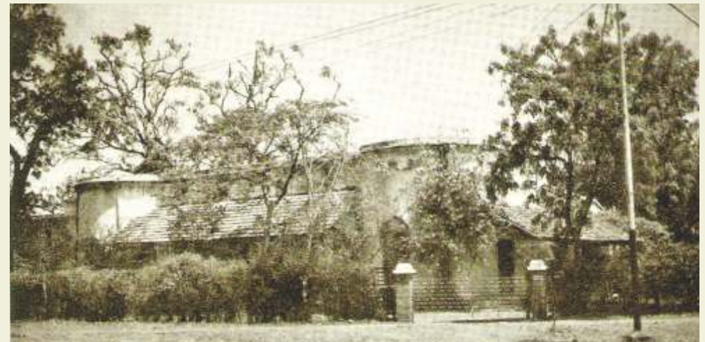
Oldest Building "White House" on the Campus (1856)