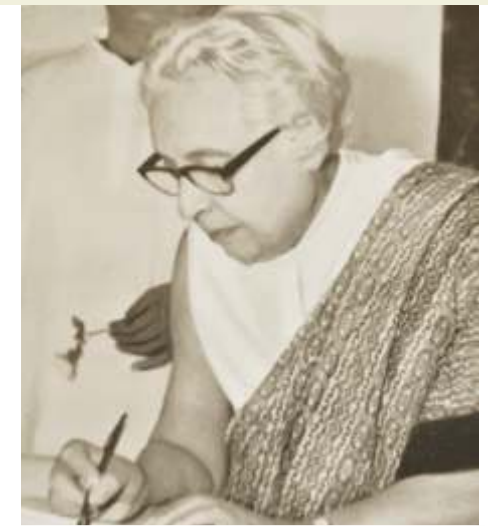
Smt. Vijayalakshmi Pandit, 1977