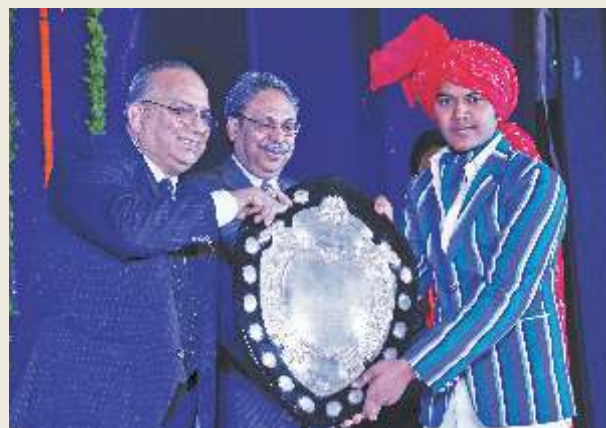
Hon'ble Shri Anang Patnaik (Ex RKCian) Retd. Justice, Supreme Court of India 2014-15