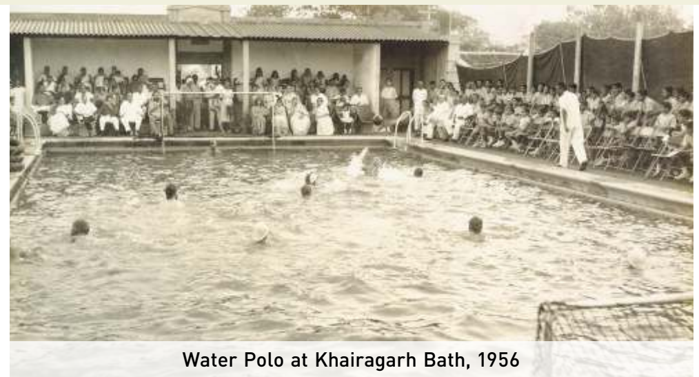
Water Polo at Khairagarh Bath, 1956